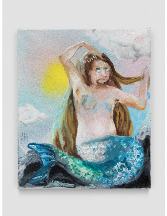
Klodin ERB, Mermaids #5 (from the series 'Mermaids'), 2023, Ink, oil, acrylic spray paint and acrylic glitter paint on raw canvas 42 x 35 cm (16 1/2 x 13 3/4 inches)