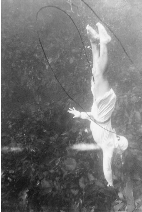
Kusukazu URAGUCHI, Sous l'eau , 1965, Photography Courtesy of the Uraguchi Estate